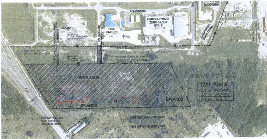
CONCEPTUAL DEVELOPMENT PLAN FOR EAST IITF PARCEL

NOTES: 1. THE APPROXIMATE WETLAND LINES ARE BASED UPON WETLAND JURISDICTIONALS APPROVED BY DEP AND THE COC IN THE WACB.