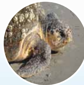
Endangered sea turtles use local beaches for nesting. The vulnerable babies head for the sea as soon as they hatch.