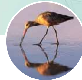
Sandpipers and other shorebirds are regular visitors of Jetty Park beach.

We want you to have the good time you came for, so we monitor all beach conditions with potential to spoil the fun. Please check for warning flags flying over the lifeguard station and know what they mean for your day at the beach.