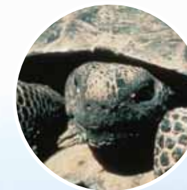
Gopher tortoises excavate burrows in the dunes which also provide shelter for other threatened species such as the indigo snake.