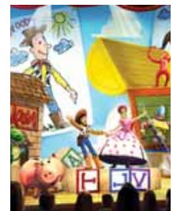
On the cover Disney Toy Story rendering. See story on page 8.