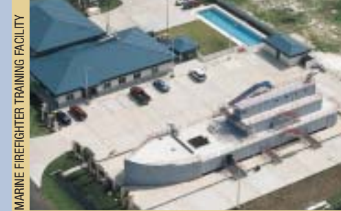
MARINE FIREFIGHTER TRAINING FACILITY

April 8, 1997 Dedicated the expansion through minor modification of the FTZ 136 General Purpose Zone to a 24-acre site in the Tate Industrial Park, Cocoa, Florida.