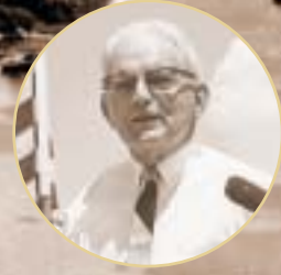
SENATOR SPESSARD L. HOLLAND