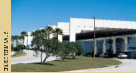
CRUISE TERMINAL 5

August 1990 The Morton Salt facility on north side of the Port became operational, receiving first shipment of salt.