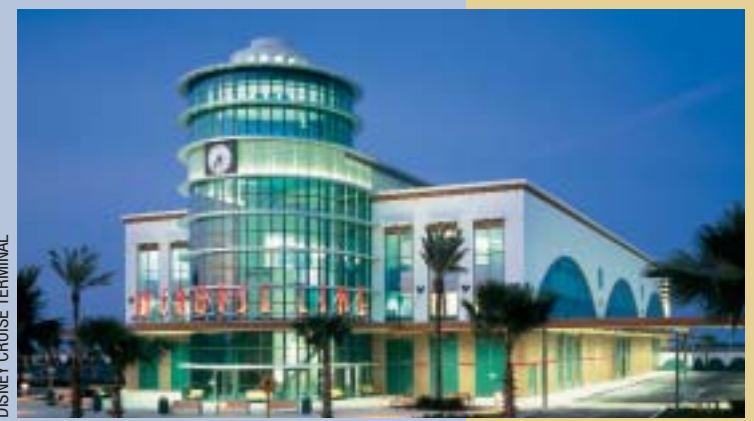
DISNEY CRUISE TERMINAL

December 13, 2000 A state-of-the-art gateway into the Port's South Cargo area opened. The new South Intermodal Gate speeds up the process of transferring freight between trucks and ships, making tracking shipments easier.