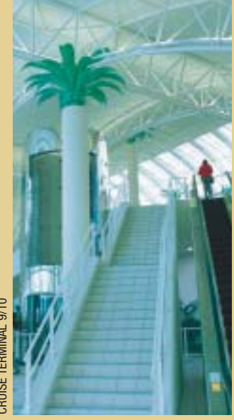
CRUISE TERMINAL 9/10

June 16, 2000 The port's new cargo-container terminal received its first shipment in the form of more than 1,000 cases of Italian wine and crystal wine goblets.