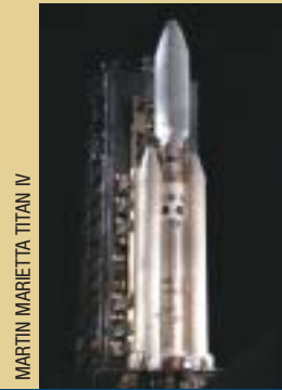
MARTIN MARIETTA TITAN IV

August 29, 1994 Held groundbreaking ceremony for Port Canaveral Sand Bypass System to lengthen and sandtighten South Jetty and put 625,000 cubic yards of sand on the beach south of the South Jetty.