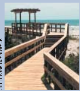
JETTY PARK BOARDWALK

March 6, 2002 Sterling Casino Lines surpassed its two-millionth-passenger mark. Sterling's Ambassador II was hailed as the "World's Largest Casino Ship."