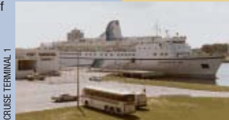
CRUISE TERMINAL 1

May 23, 1983 Cruise Terminals 2 and 3 dedicated by Congressman Bill Nelson.